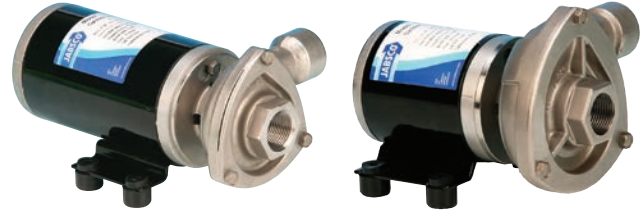
50840 Series Low Pressure Pump